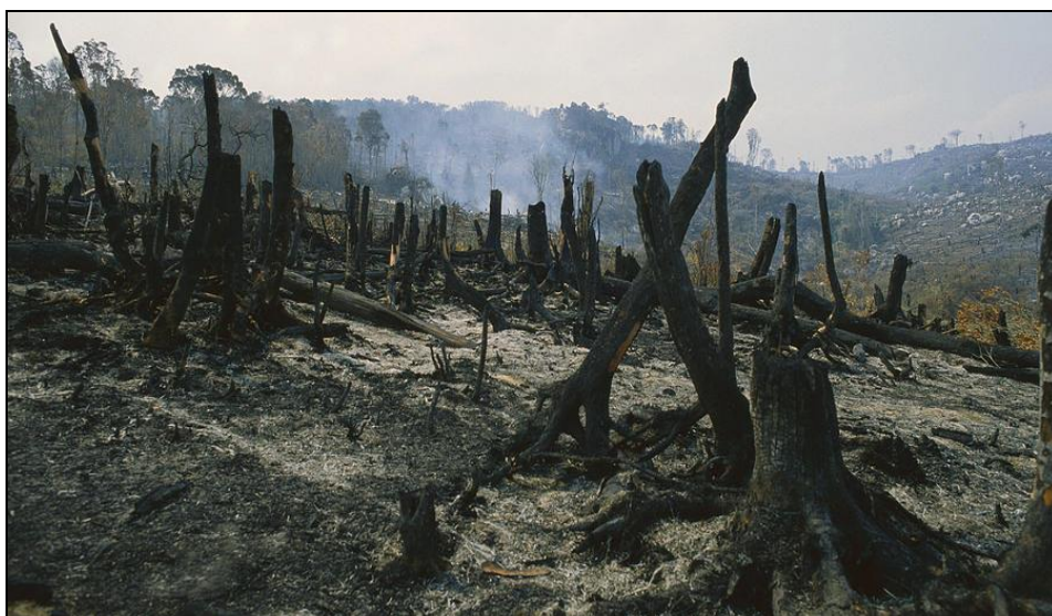
Figure 1: Forest Compartment Affected by Escaped Fire during Land Preparations