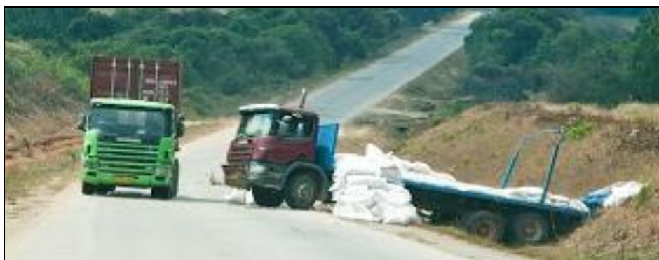
Figure 5: Combustion from Moving Vehicles can Result into Forest Fires when fire sparks get contact with dry grasses

In forest stands passed by the Tanzania to Zambia highway there are cases where forest fires have been resulting from combustion or ignition from vehicles (Figure 5). This includes combustion from vehicles and other machinery especially those employed in road construction, timber processing and heavy trucks used in loading and unloading of logs.