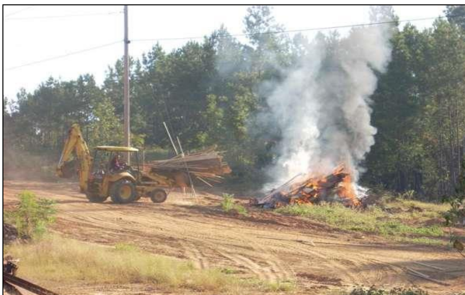
Figure 3: Burning of slabs near Forest Stand can Facilitate Forest Fire if done without Precautions