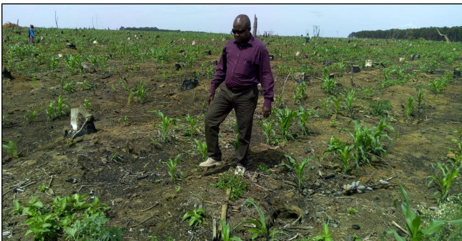
Figure 8: Farmers are allowed to Cultivate Maize in Trees Harvested Areas through Participatory Approach Communities

“We initially thought that PFM could address the dilemma. However, it is against all odds. Apart from continuing incorporating PFM principles, we are also using the special security guards to protect the forest because there are community members who do not adhere to principles” (July, 2018).