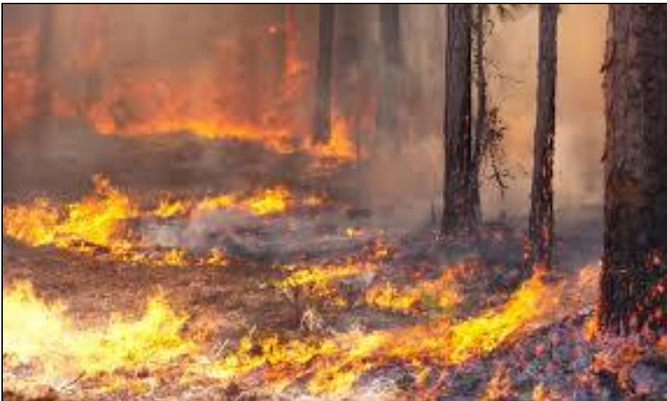
Figure 6: Forest Fires Destroy Planted Trees and General Ecosystem

Forest fire is ecologically and economically destructive at SHFP, and the loss of trees was the top ranked impact (77.8% of the respondents) followed by destruction of assets like houses, saw milling machines and vehicles. Forest fires suppress the re-growth of more resistant species and prevent woodland canopy which suppress herbaceous production and reduce fuel loads. Furthermore, fires slow down ecological regeneration capacity and impact the future extension strategies. Forest fires destroy land structure and make the area prone to soil degradation (Thompson et al 2013; Sebata, 2017 and Neary & Leonard, 2020). Fires destroy soil, microbes, pollinating insects and wild animals that support biological functioning that finally affect regeneration (Figure 6).