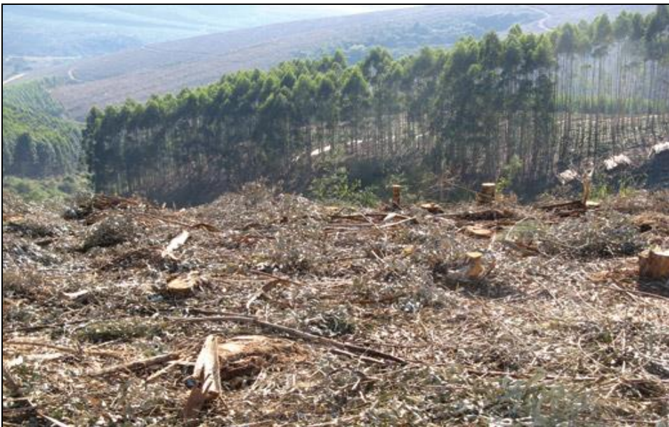
Figure 2: Poorly Handled Tree wastes Left after Harvesting Operation

As suggested from the quotation above, the dry season is also the peak of harvesting season. Activities like logging and timber processing result into accumulation of wood wastes which could become dangerous during dry season (Figure 2). It has been estimated that in order to produce 45 tons of timber, 55 tons of waste is created in the form of sawdust, treetops and branches, and is left to decay, burnt on site or collected as wood fuel, hence creating a potential danger to the forest plantation if left unmanaged.