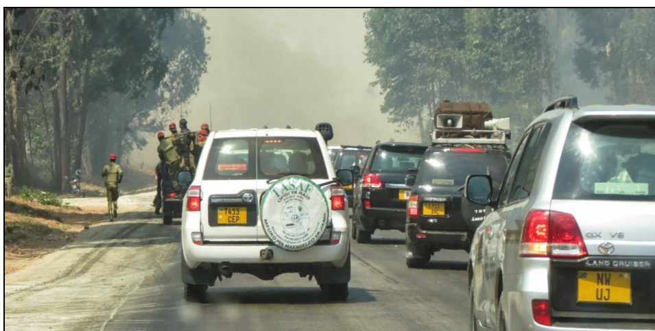
Figure 7: A Queue of Cars Stopped by Heavy Smoke from Burnt Forest at Sao Hill Forest

The prolonged fires contribute to climate change by the release of green house gases and contribute to massive heat and smoke which might hinder other socio-economic activities (Figure 7).