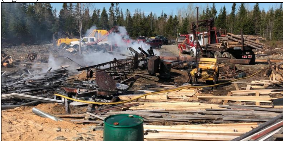
Figure 4: Fire caused by Sparks from Machines that make Forest Stands Prone to fire Incidences

Accidental causes of forest fires include failure of electric lines, sparks emitted by vehicles. This is especially dangerous in mobile sawmills which operate inside the forest stands in situation whereby the terrain is too difficult to justify pulling the logs out of felling site. During field survey the researchers witnessed the sparks from operating machines, which caused escaping fire by wind force to the nearest forest leftovers (Figure 4).